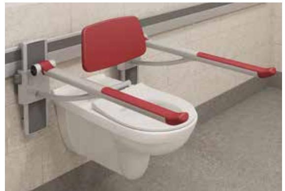
R3548: Toilet support arm with horizontal wall track, height-adjustable 250 mm, length 850 mm.