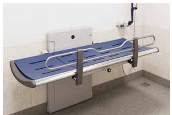
R8518: Nursing bench, height-adjustable with electric motor and remote control.