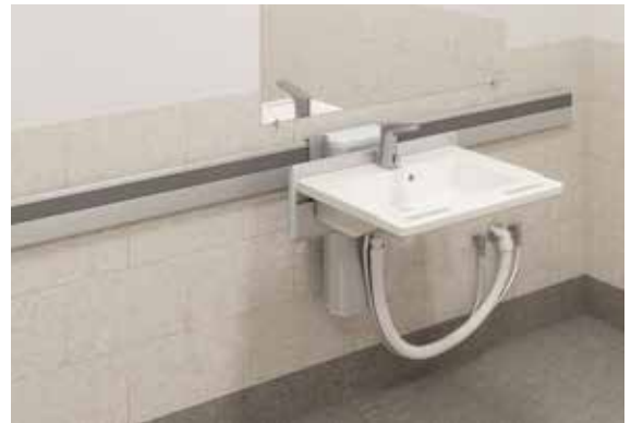
R4760: Washbasin bracket with gas cylinder, height-adjustable 300 mm. Pictured here with ergonomic washbasin R2050 and the RT622 tap.

” The key to a functional bathroom is a systematic assessment of the needs of the user and the carer as well as the room’s possibilities.