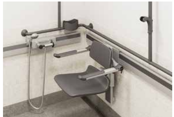
R7566: Shower chair 410. Height-adjustable 330 mm. It is possible to adjust the height of the seat and back rest independently of each other. Shown here with handrail/shower head with shower mixer bracket RT756.